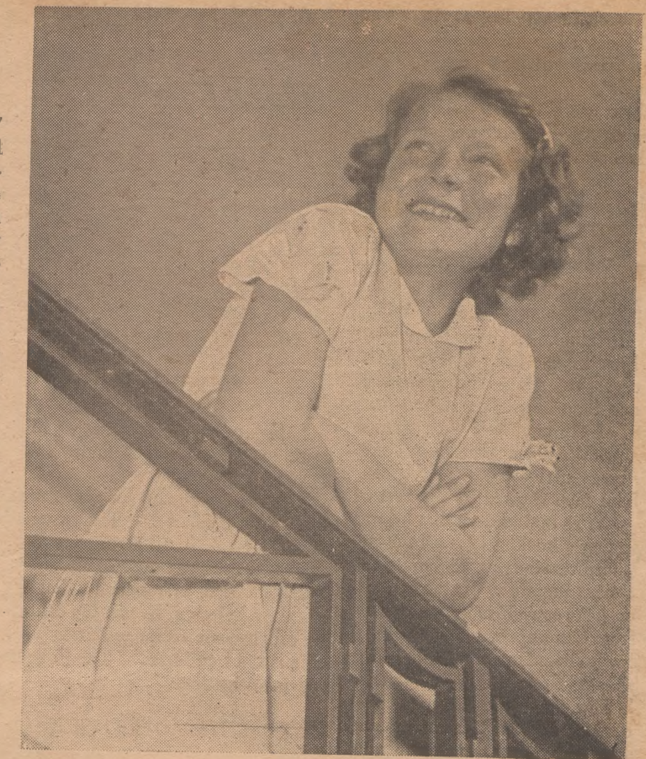
PRINCESS IRENE 13 YEARS OF AGE.